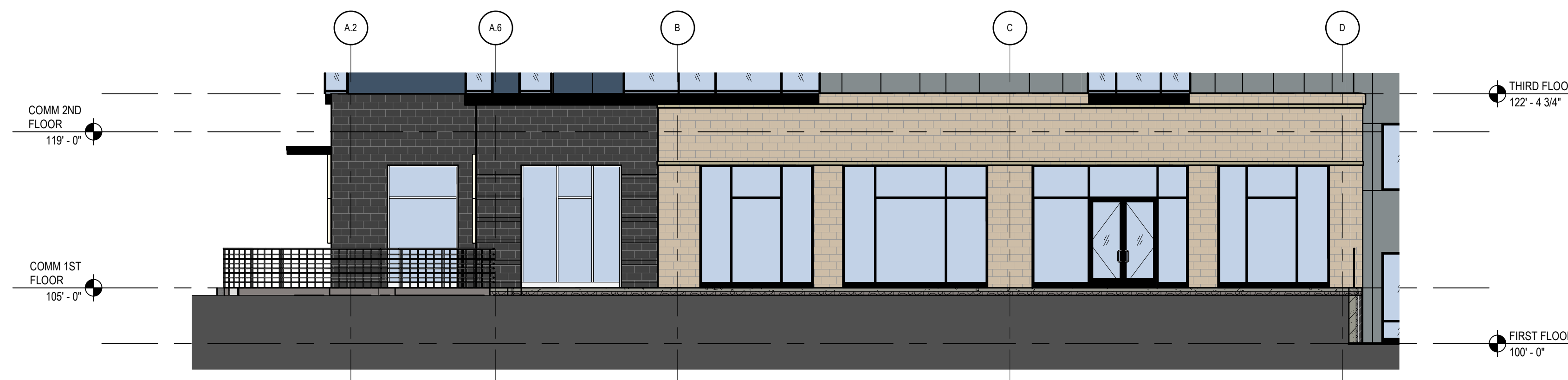
3 east elevation - east side tenant L2.14 1/8" = 1'-0"