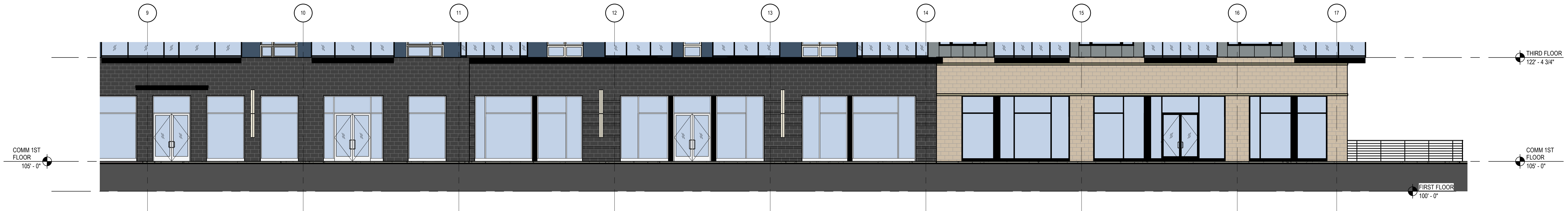
2 south elevation - east tenant L2.14 1/8" = 1'-0"